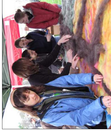
Students at the University of New Hampshire

Hands-on programs, integrating art and environmental education, result in more meaningful understanding and appreciation of the subjects explored.